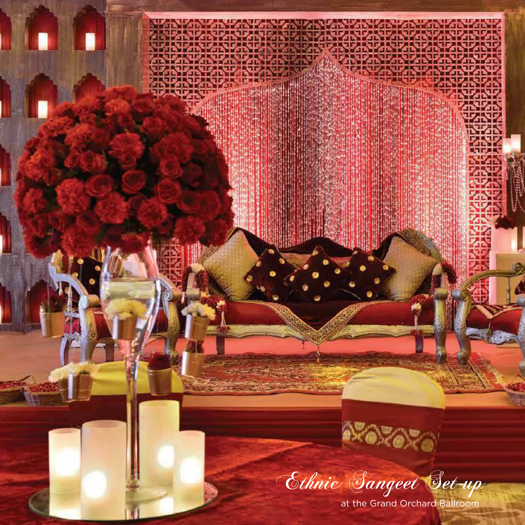
Ethnic Sangeet Set-up at the Grand Orchard Ballroom