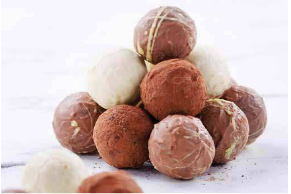
Marshmallow, Macaroons and Chocolate Truffles