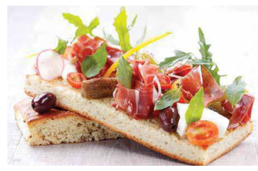
Ham and Cheese Sandwich