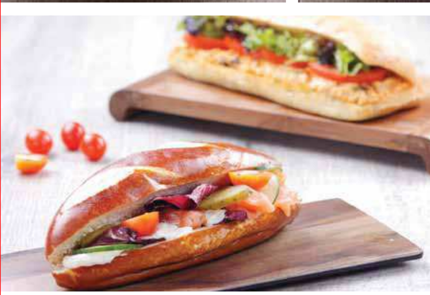
Salmon Pretzle Sandwich Chicken Curry Sandwich